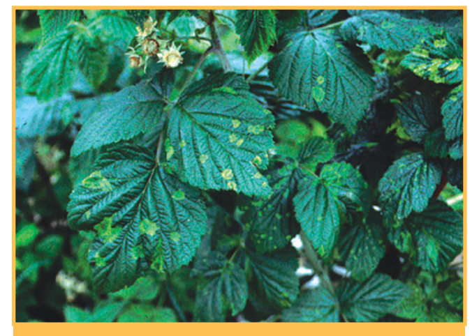
Figure 2. Shock symptoms of Tomato Ringspot Virus on 'Royalty' leaves at Blackstone, Virginia.

TomRSV reproduces in cells of many broadleaf plants but not in grasses or corn (monocots), and it is vectored (carried from plant to plant) by dagger nematodes