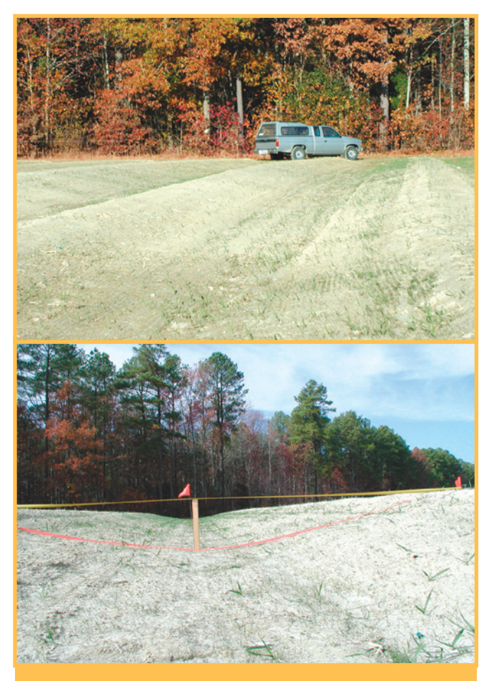
Figure 1-a,b. High, wide raised-beds are suggested for both raspberries and blueberries.

Gently sloping (2-3%) fields are desirable because water tends to flow across the soil surface and away from the site during periods of excess rainfall. Good surface drainage shortens the time during which soil moisture conditions favor Phytophthora zoospore production and movement, but it also increases the distance and speed of zoospore movement within the field. Thus, during pre-plant site preparations, it may be prudent to install grassy drainage swales, berms or raised-beds that segment the drainage pattern and delimit areas within which spore dispersal is likely to occur. Raised beds are recommended as means of improving aeration and soil drainage for essentially all sites on which raspberries might be planted in Virginia (Figure 1-a,b).