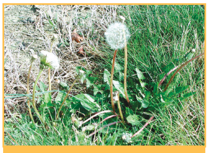
Figure 3. Mature dandelion flower with seeds ready for dispersal by wind.

TomRSV and its vector(s) may not exist on a proposed site but the following precautions are strongly suggested: