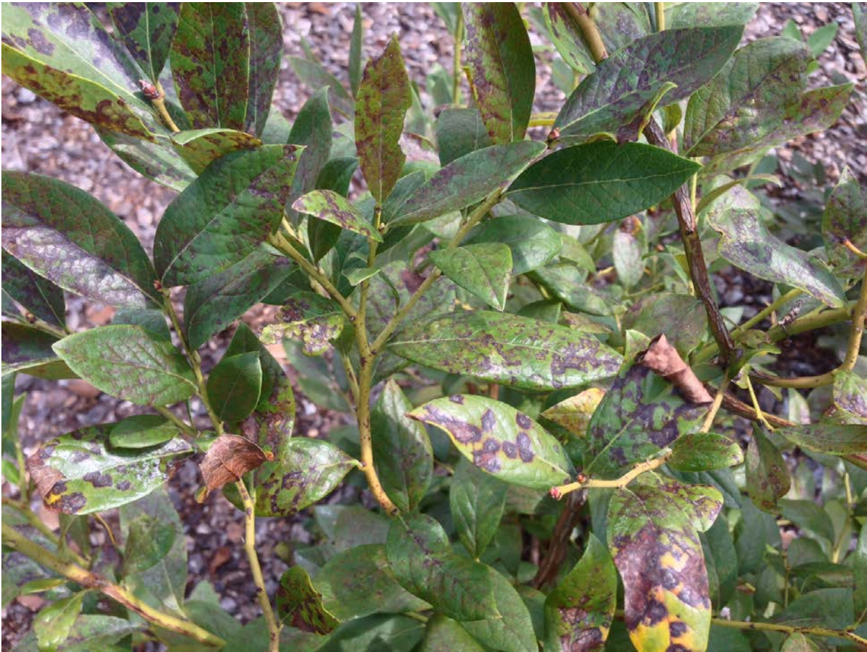
Figure 3. Blueberry necrotic ring blotch virus symptoms. These severe viral symptoms were observed in an organic blueberry production site. An adjacent site was treated with insecticides that have purported activity against eriophyid mites, and no disease was observed. The sites are separated by an open distance of ~50 yards.