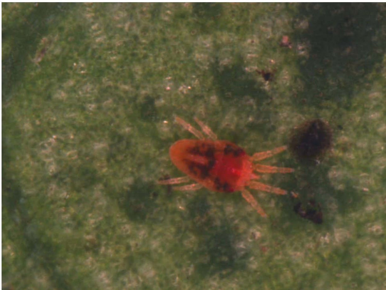
Figure 4. Brevipalpus spp. mites found in association with BNRBV infected plants. In addition to eriophyid mites, this is another potential vector of BNRBV, since it is a known vector of citrus leprosis virus , a virus which is related to BNRBV.

Conclusions: As a result of this research, we cannot definitively conclude that insecticide or miticide use will decrease BNRBV through management of the vectors, but the information gained does support the premise that this may be the case.