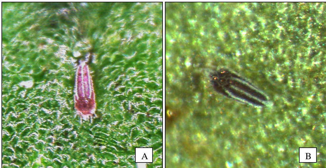
Figure 2. The eriophyid mite shown above has been found in Georgia (A) and Florida (B) in association with blueberry necrotic ring blotch virus infected plants. It is a presumptive vector of the virus, and to date, it has not been identified to species.

Recently, an eriophyid mite was identified in both Florida and Georgia that is closely associated with symptom development in the greenhouse and field (Fig. 2). It is a presumptive vector of the virus. Tissue-cultured plants, free of virus, have obtained the virus within a short period of time in both the greenhouse and field when the mites are present – guilt by association. Definitive transmission studies have not yet been conducted, but the need for field management is immediate. As such, we proposed that field trials be conducted to determine whether mite management would result in less BNRBV disease symptoms and subsequent plant health reduction.