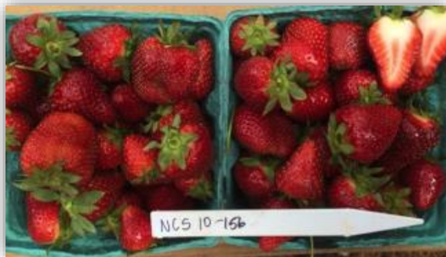
Figure 2. NCS 10-156, and elite selection from the NCSU strawberry breeding program, with moderate to high yields, excellent flavor and starts producing fruit early in the season.