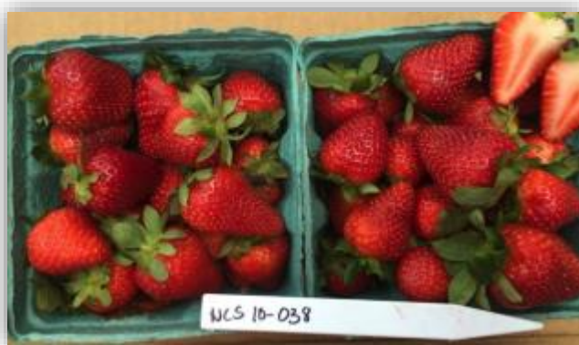
Figure 1. NCS 10-038, an elite selection from the NCSU strawberry breeding program, with very high yields, moderately firm fruit, with peak production in mid-season.