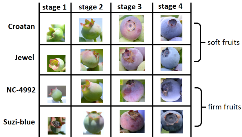
Figure 1: Blueberry fruits at different stage of ripening