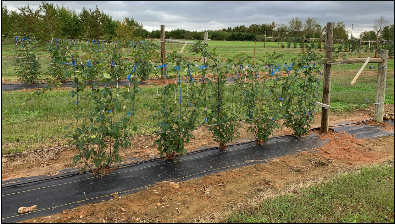
Figure 1. Ouachita blackberries where the yield impact trial was established. This picture shows the plot layout of 5 plants per plot with a 5 ft buffer between plants.